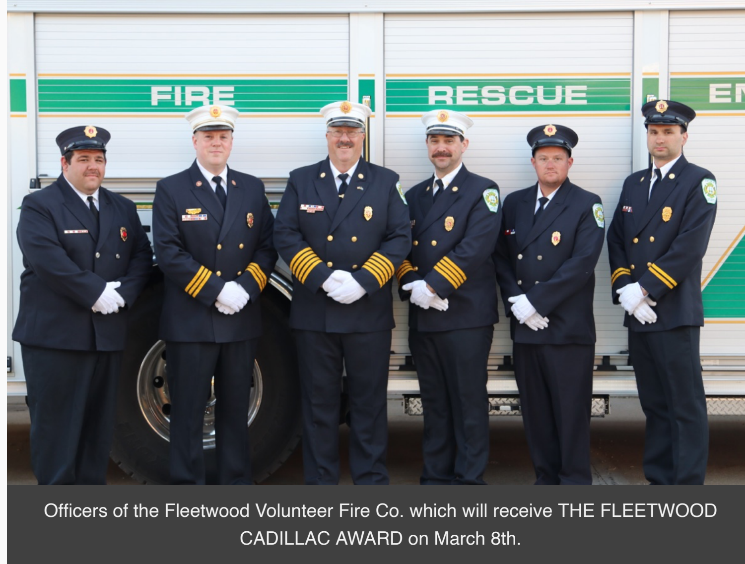
Officers of the Fleetwood Volunteer Fire Co. which will receive THE FLEETWOOD CADILLAC AWARD on March 8th.